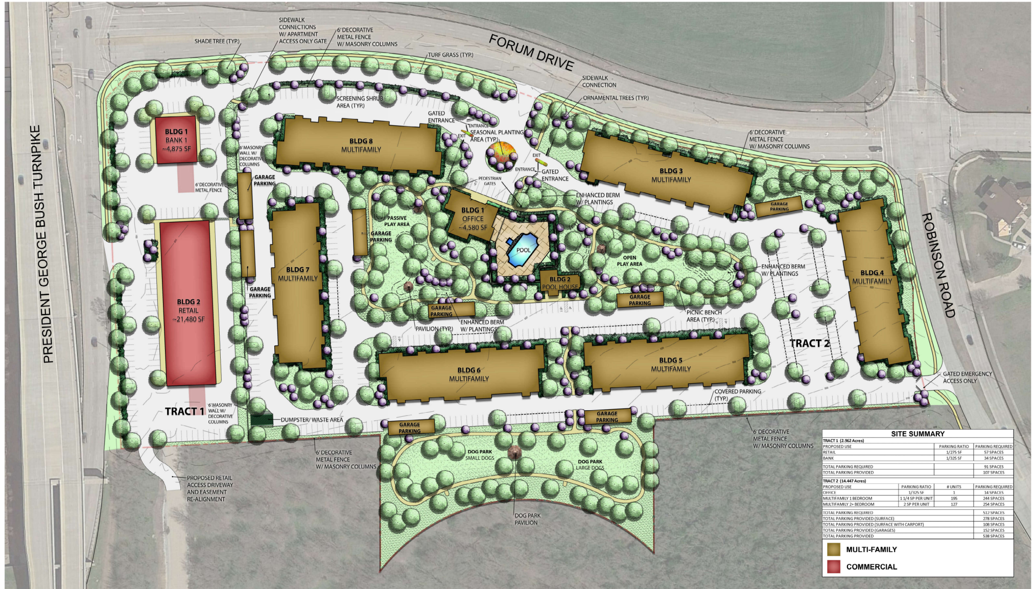
Exhibit C - Concept Plan Page 1 of 2