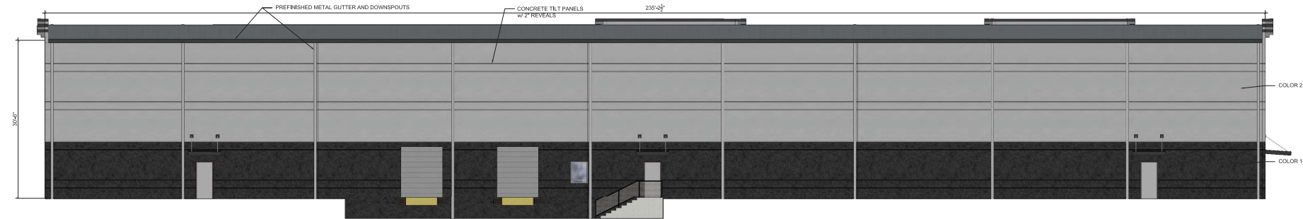
2 WEST ELEVATION SCALE: 1/8" = 1'-0"