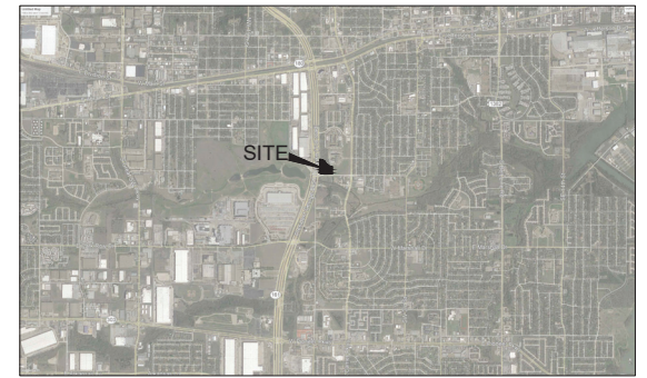
AERIAL - N.T.S.

Total Building Area: 281,772 SF @ 850 SF avg. unit size 70,443 SF/lvl x 0.82=57,763 SF/850= 68 units/lvl @ 4 levels = 272 units Total 136 units x 1.5 sp. & 136 units x 1.25 = 374 spaces req. Total Parking Structure Area: 135,300 SF 410 spaces prov. @ 5 levels+16 surf. sp.= 426 sp. Total prov. Site Area: 4.29 Ac. Site Coverage: 37.68% 63 units/ Ac.