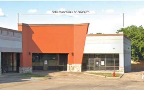
CURRENT ELEVATION OF LEASE SPACE NOT TO SCALE

SPECIFIC USE PERMIT - ENCHANTED EVENT HALL CASE NUMBER: SU190102