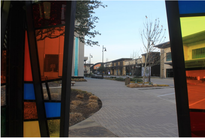
EXHIBIT F-1: APPENDIX F DESIGN GUIDEBOOK