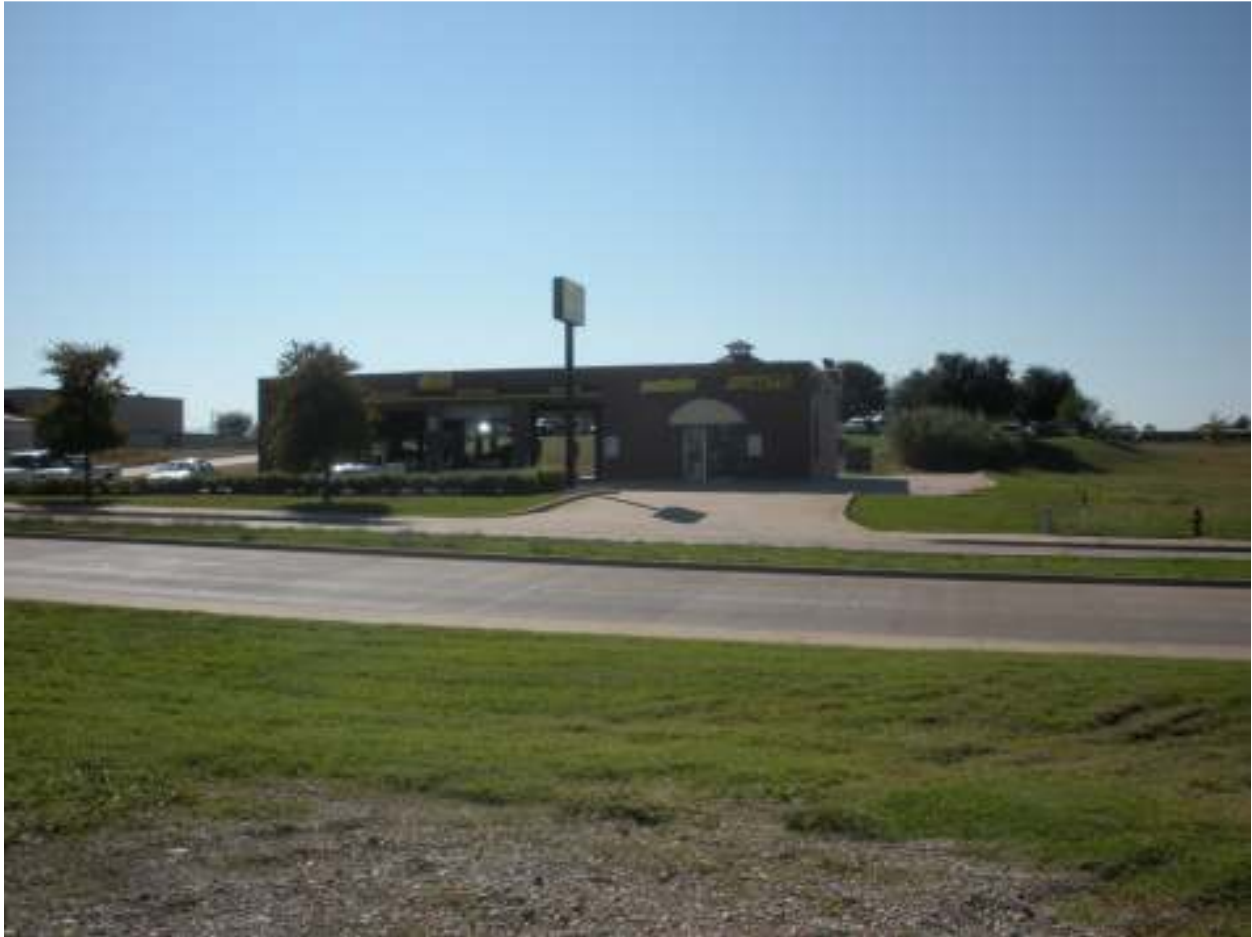
NORTH ELEVATION SEEN FROM KINGSWOOD DRIVE