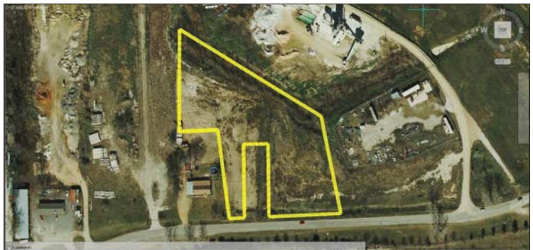
Aerial Not to Scale