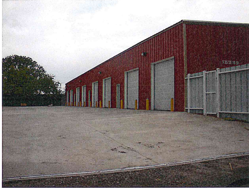
South Side of Subject Site