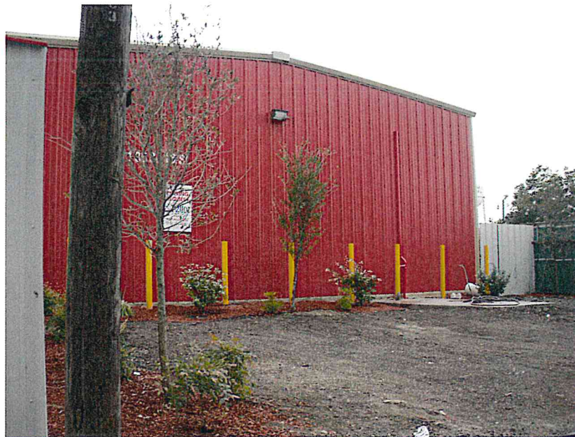
Front Façade Facing S.E. 16 th Street