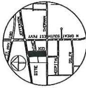
Exhibit B - Phase One Site Plan