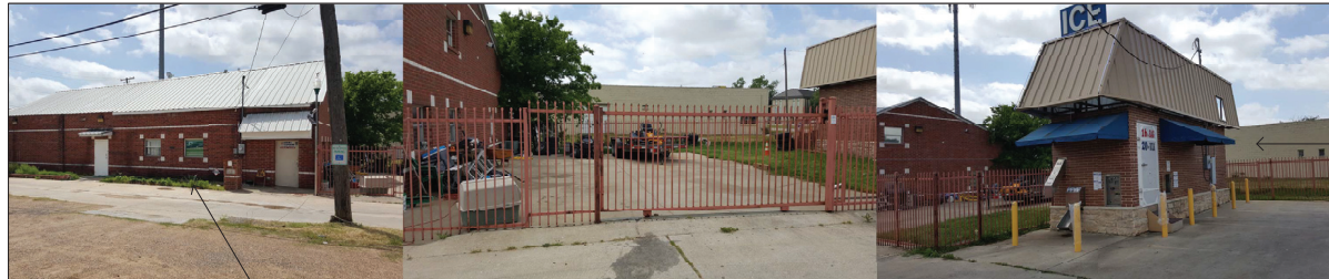
FRONT OF BUILDING (NORTH SIDE)