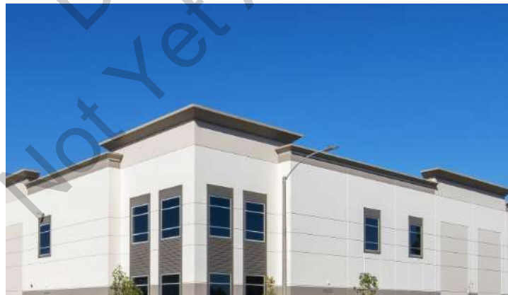
Figure 2-X - Cornice Projection