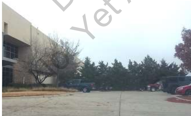
Fig. 7-X- Wing wall consisting of living screen