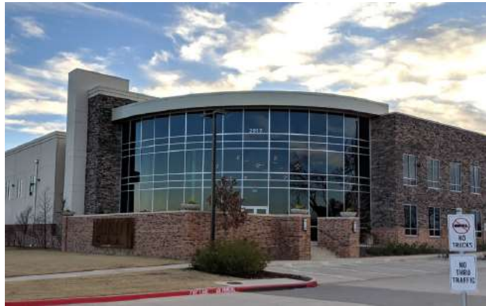
Figure 1-X Glass Curtain Wall