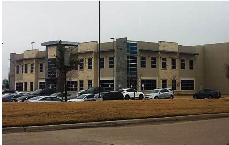
Figure 3-X - Vertical and Horizontal Building Articulation