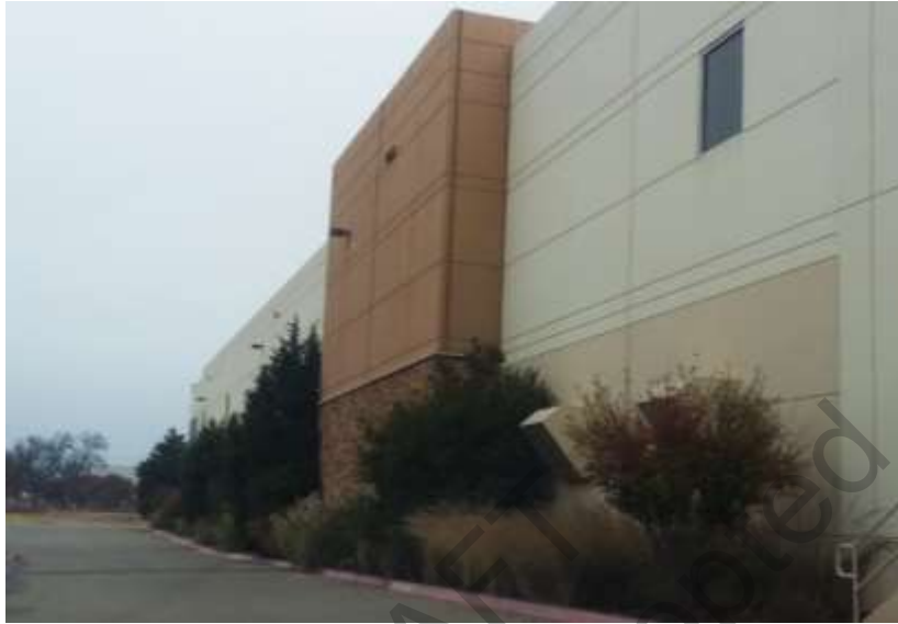
Figure 6-X Landscaping along the base of a façade