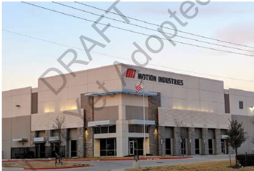
Figure 4-X – Accent Lighting